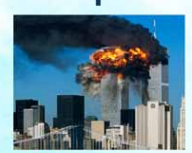
PROJECT: Imagination is better than knowledge. The unsafe future